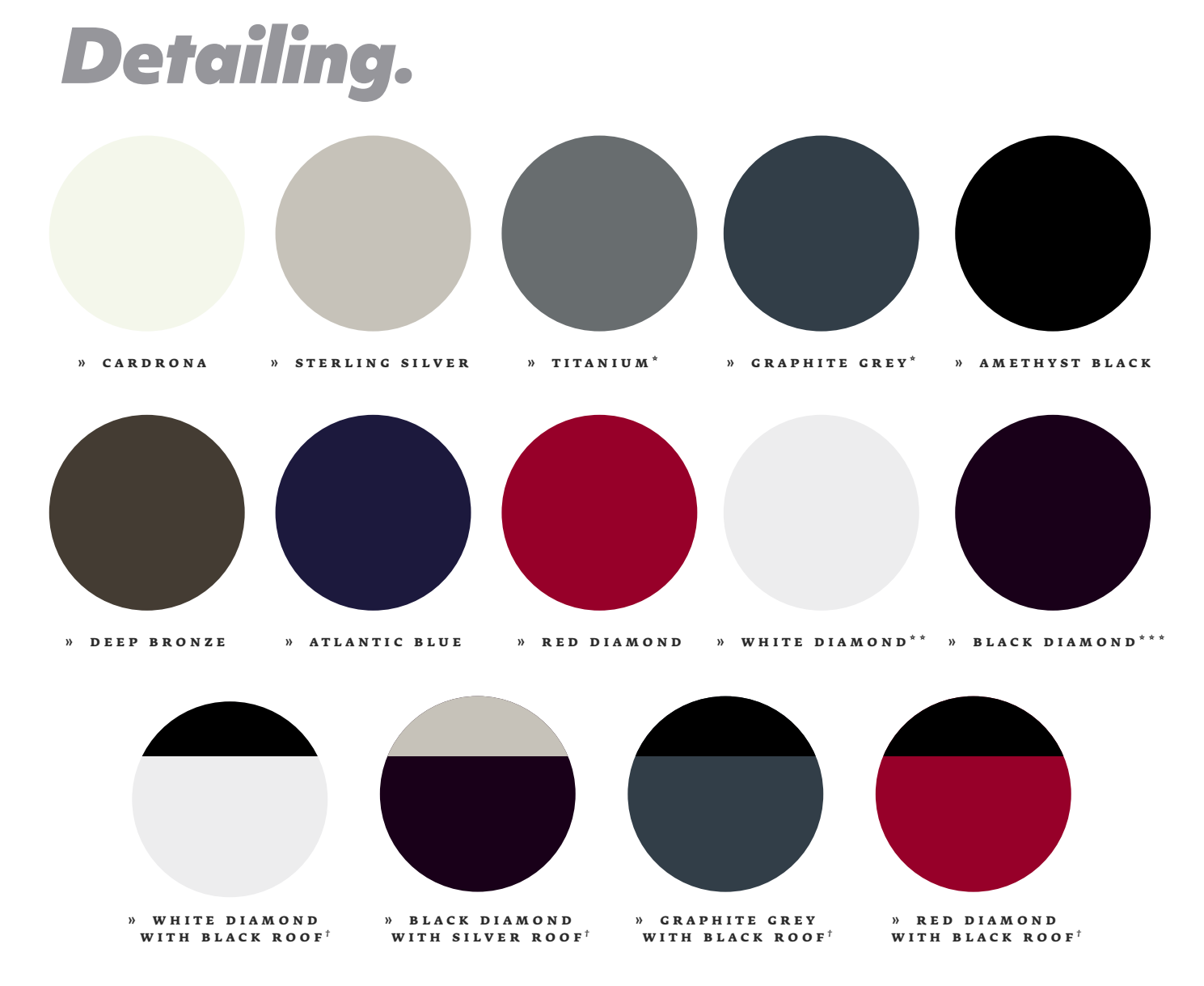
*Graphite replaces Titanium from December 2023. **Only available on VRX. ***Only available on VRX and Exceed. †Only available on Exceed

While we have made every effort to ensure that the specifications are correct at the time of printing, Mitsubishi product is constantly developing. We reserve the right to change the specifications, colours and prices of models and items within this brochure. For current specifications always contact your Mitsubishi dealer,