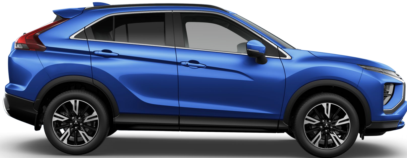
» Eclipse Cross 2WD XLS in Electric Blue.