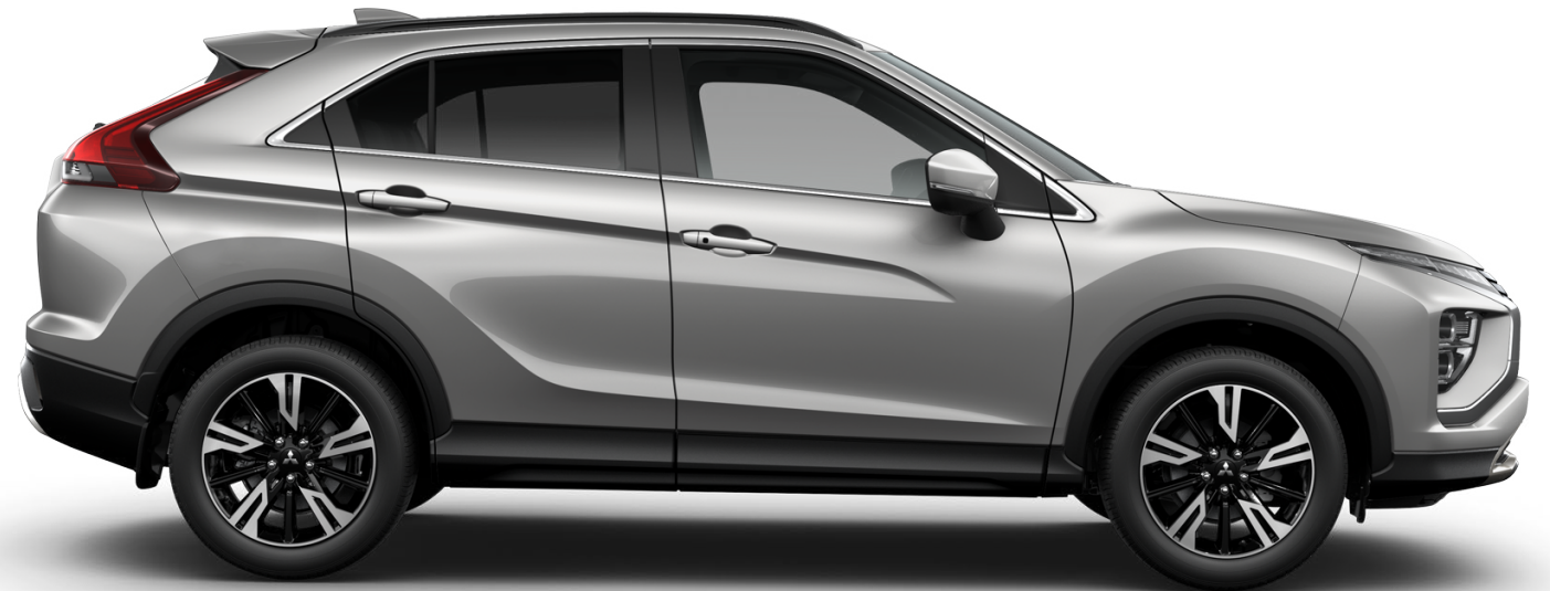
» Eclipse Cross AWD VRX in Sterling Silver.