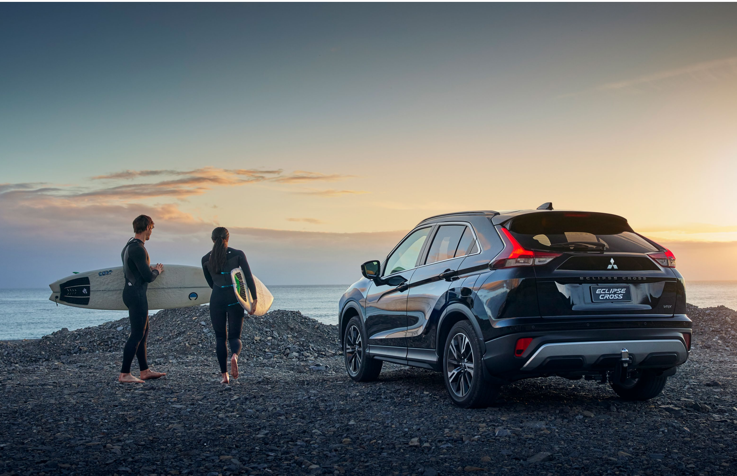
» MODEL SHOWN ECLIPSE CROSS VRX in Amethyst Black with optional accessories.