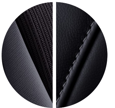
» Eclipse Cross AWD XLS Cloth Trim. » Eclipse Cross AWD VRX Leather Trim.

XLS HAS THE SIGNATURE ECLIPSE CROSS STYLE AND SMART TECHNOLOGY, VRX ADDS REAL LUXURY. BOTH MODELS OFFER THE SAFETY AND DRIVING EXPERIENCE OF ALL-WHEEL DRIVE.