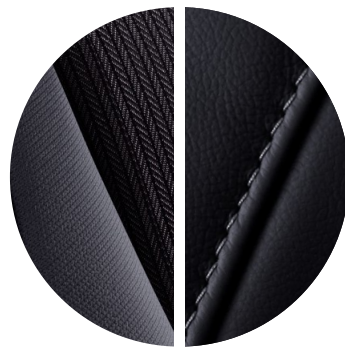
» Eclipse Cross 2WD XLS Cloth Trim. » Eclipse Cross 2WD VRX Leather Trim.

CHOOSE FROM THE SHARPLY DESIGNED AND WELL-EQUIPPED XLS OR THE LUXURIOUSLY APPOINTED VRX.