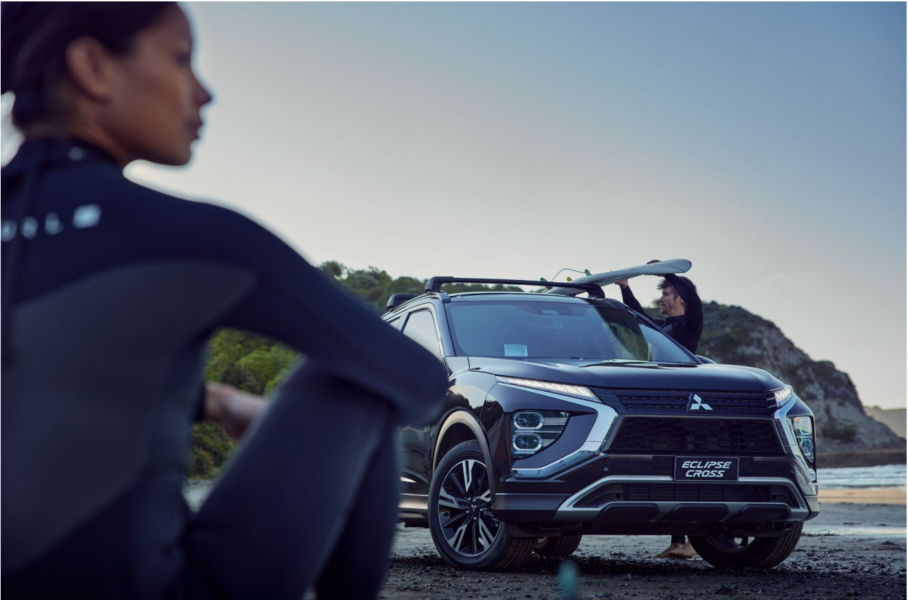
» MODEL SHOWN ECLIPSE CROSS VRX in Amethyst Black with optional accessories.

ECLIPSE CROSS BRINGS YOU FEATURES BEYOND THOSE YOU WOULD EXPECT FROM AN SUV.