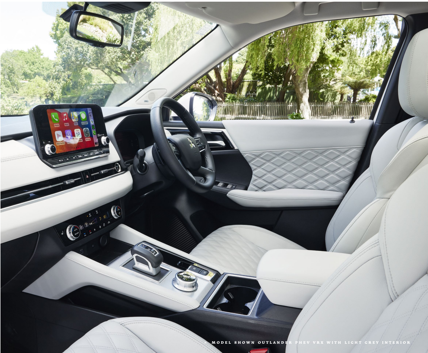
» MODEL SHOWN OUTLANDER PHEV VRX WITH LIGHT GREY INTERIOR

With your smartphone set in the wireless charging dock, you push the start button and in that moment you become the centre of attention. All you'll hear is silence as the twin electric motors wake a galaxy of technology that instantly link together to take care of you and your passengers.