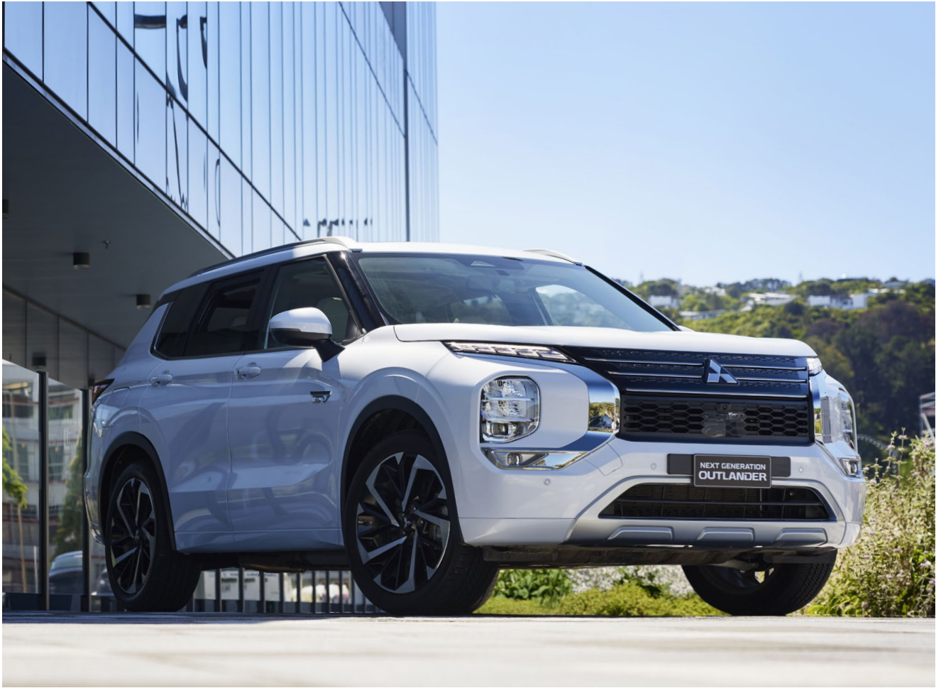
» MODEL SHOWN OUTLANDER PHEV VRX in White Diamond.