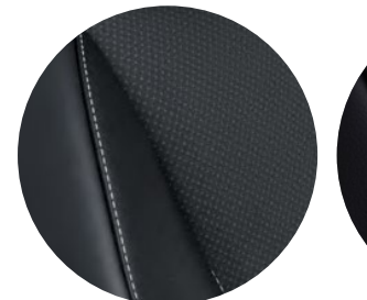
» Eclipse Cross PHEV XLS » High Grade Cloth with synthetic leather trim.

*Fuel economy and range figures are based on the ADR 81/02 test for combined urban/extra urban driving. Fuel economy figures are calculated to WLT-3P. Please note that actual on-road fuel consumption will vary depending on traffic conditions, vehicle load and the individuals' driving styles.