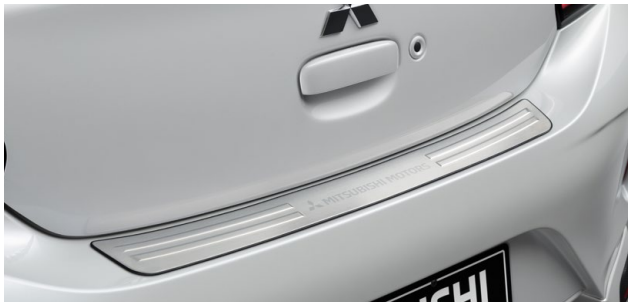
REAR BUMPER GUARDS