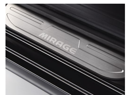
» SCUFF PLATE