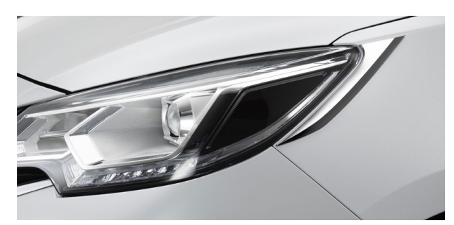
» HEADLAMP GARNISH