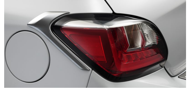
» REAR HEADLAMP GARNISH