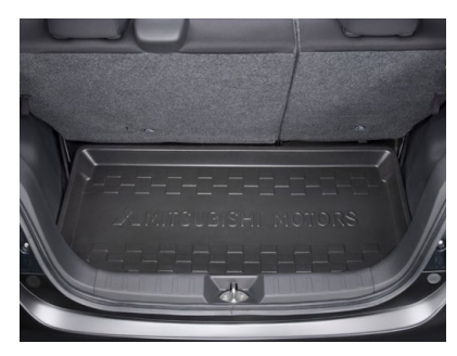
» LUGGAGE TRAY