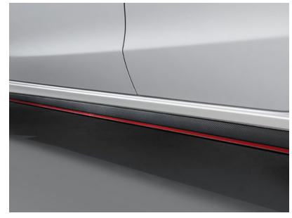
» SIDE AIR DAM