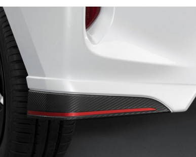
» REAR AIR DAM